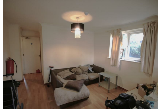
Bedroom 4 11'0" x 14'4" (3.375 x 4.383)